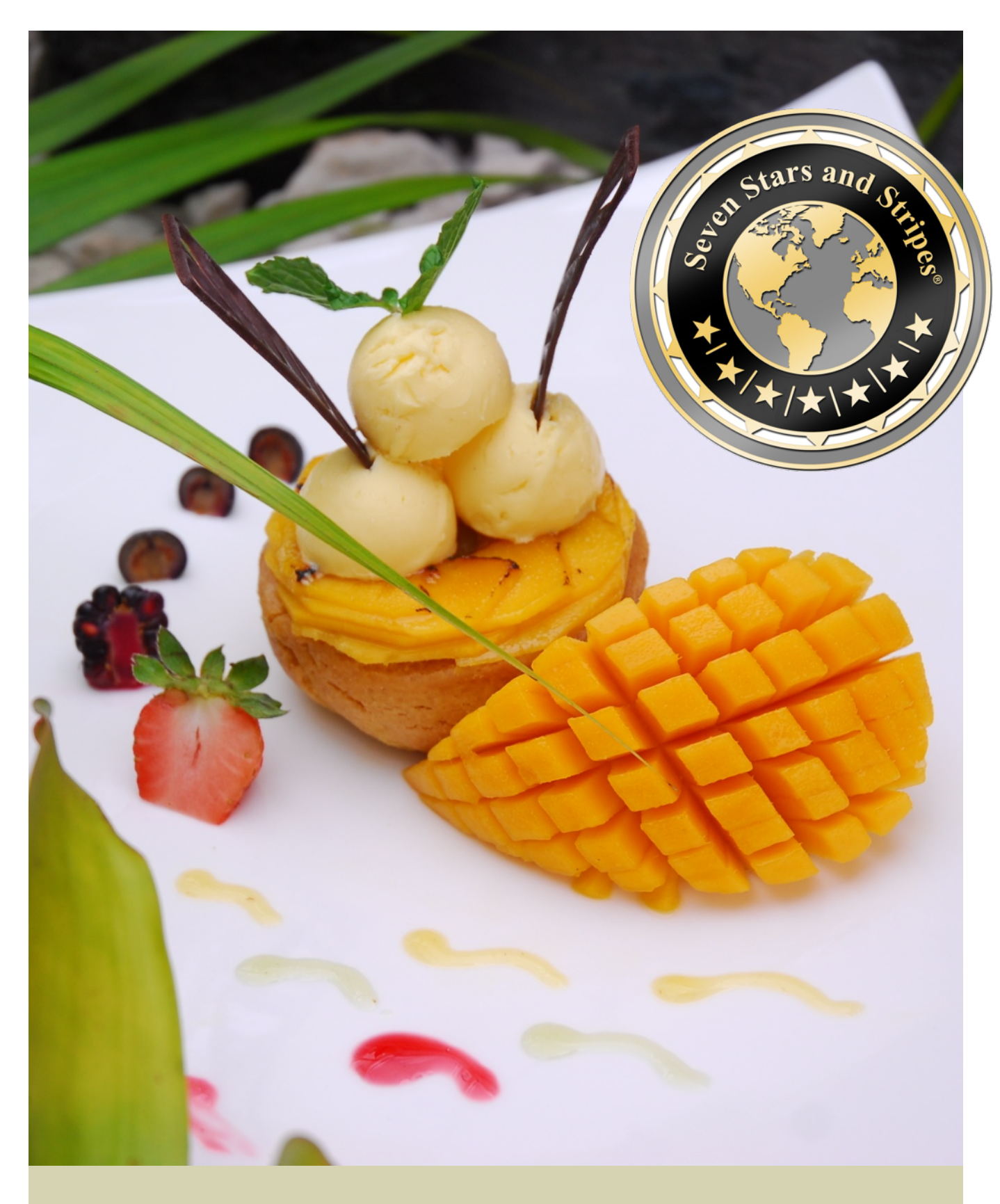
The Seven Stars Organic World<sup>TM</sup> Award